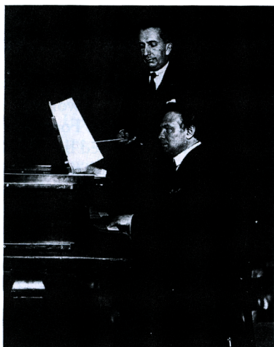
Casella & Respighi

At this time Casella made a sufficient impression to be appointed conductor of the Boston Pops concerts in 1927, 1928, and 1929.